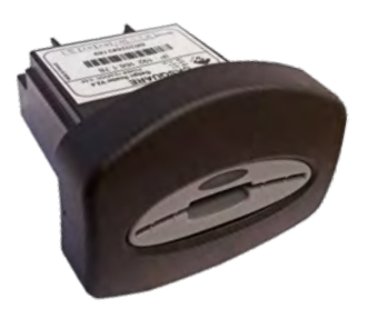
BADGIC READER Stand-alone loyalty reader

Designed and developed by CKSQUARE, this versatile and functional reader allows the insertion of all 3 sizes, and adapts to most of your carwash peripherals : jetwash, vacuum, carpet washer, etc.