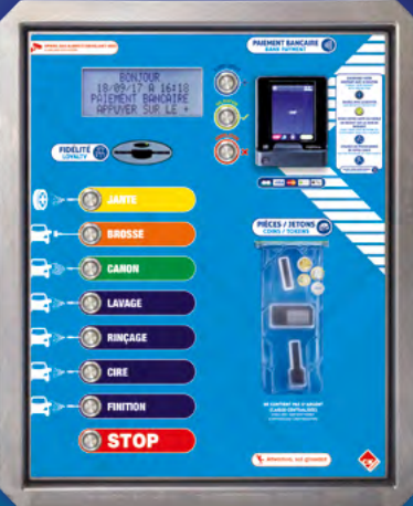
OPTIONS Payment method