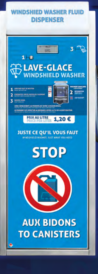
CAPACITY Up to 100 L

Optional automatic filling system available for added convenience and operational efficiency.